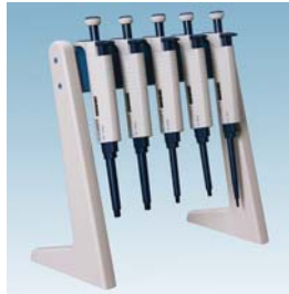
Linear Pipettor Stand

Ejector collar and tip cone can be removed