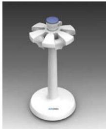
Carousel Pipettor Stand

Tip ejector allows convenient one-handed operation